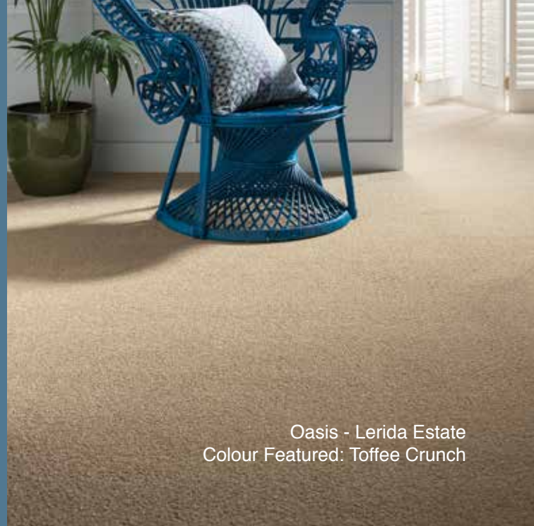
Oasis - Lerida Estate Colour Featured: Toffee Crunch

The solution dyed technology in Oasis carpet locks in the colour to the very core of every fibre.