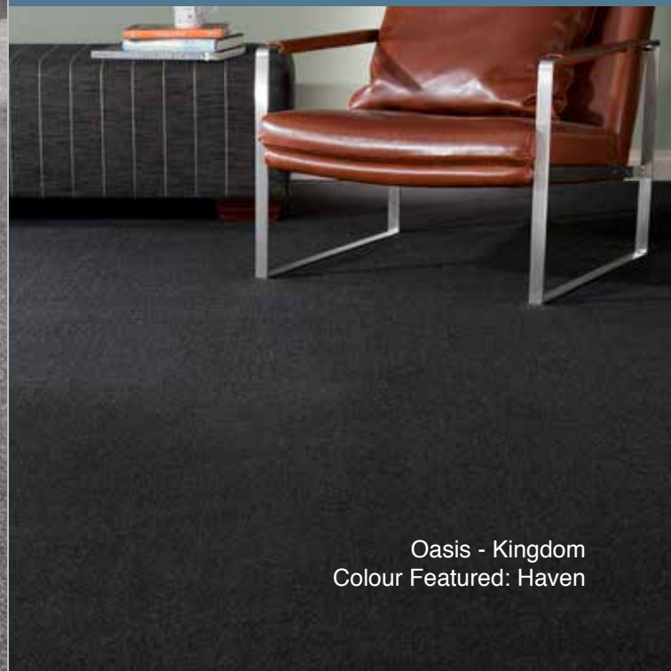
Oasis - Kingdom Colour Featured: Haven