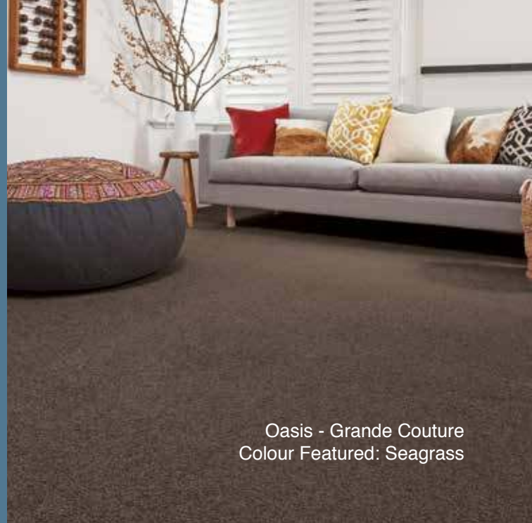
Oasis - Grande Couture Colour Featured: Seagrass

The luxuriously soft fibres of Oasis carpet provide a stylish foundation that will treat both your feet and décor.