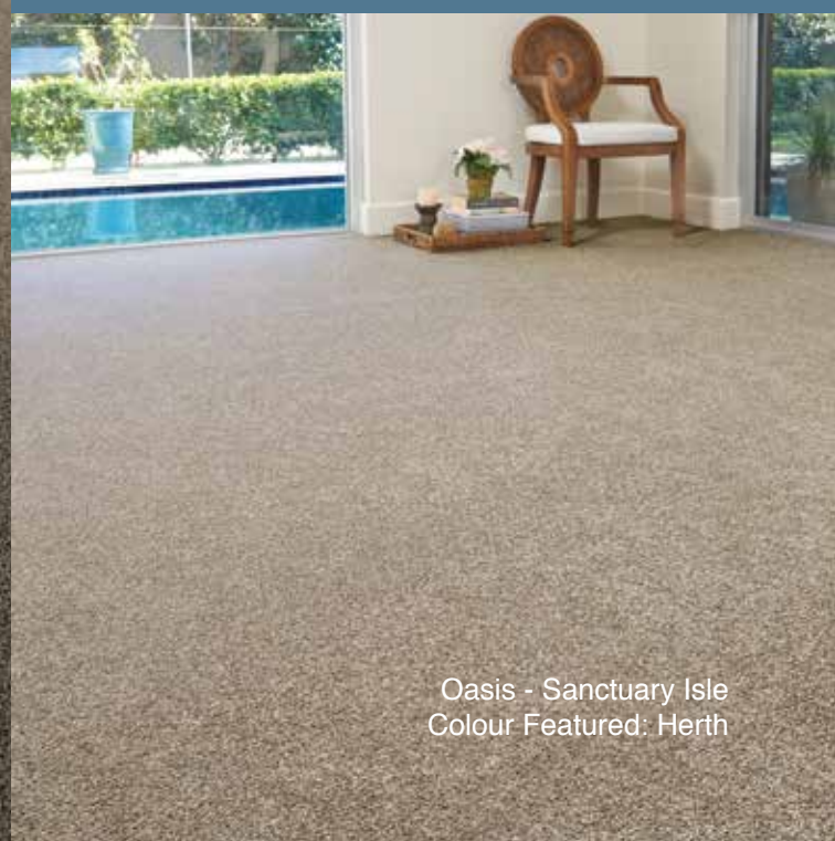
Oasis - Ninth Avenue Colour Featured: Cereal

The twist and textured designs of Oasis carpet easily hide dirt, making them a fantastic soft flooring solution for families.