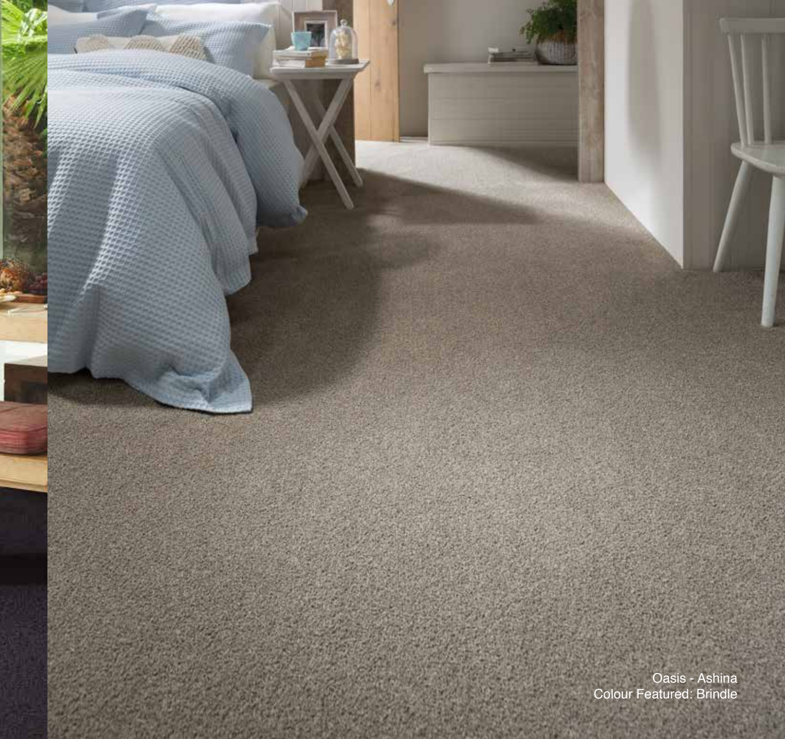
Oasis - Ashina Colour Featured: Brindle