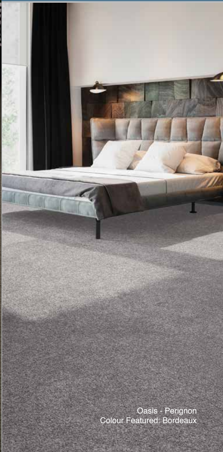
Oasis - Perignon Colour Featured: Bordeaux

With the pace of everyday life, it's easy to miss spills when they first occur. However, with Oasis carpet you can have peace of mind knowing that their stain resistant properties will help them come up like new time after time.